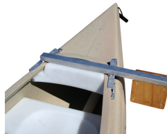
Motor bracket (front)

Can be purchased as a 2 or 3 seater Easy to convert a 2 seater to a 3 seater