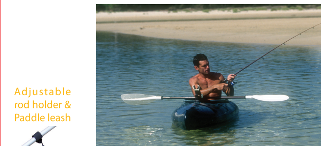
Adjustable rod holder & Paddle leash

Suitable for the whole family. Will take children as young as 6, up to 130kg adults