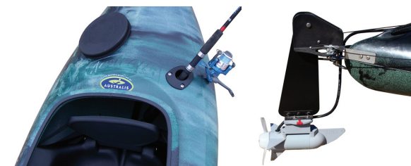
Pod & fixed rod holder