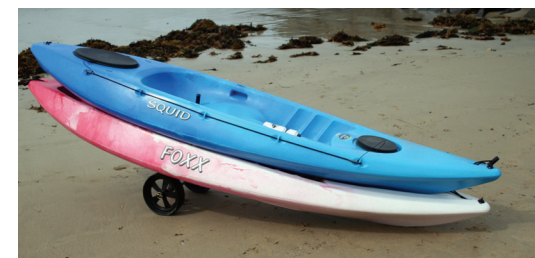
Squid stacked on a Foxx on the small Australis sit-on-top trolley (with extension poles)