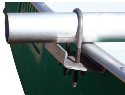
U-Bolt securing outrigger kit to Swagman