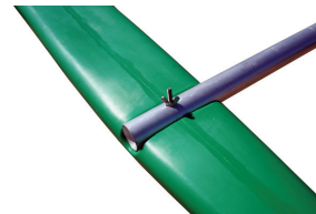
Wing nut securing outrigger float to pole