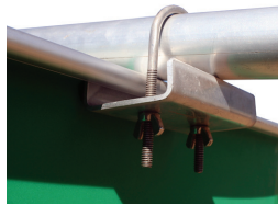
U-Bolt securing outrigger kit to Swagman