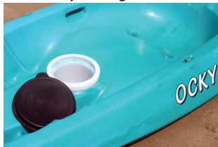
1.5 litre pod between your legs