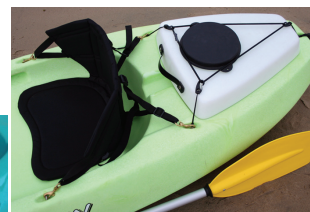
Utility Box secured by Cargo Strap